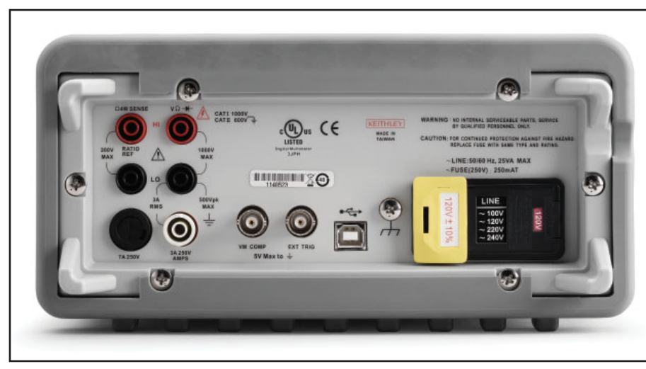
Model 2100 rear panel