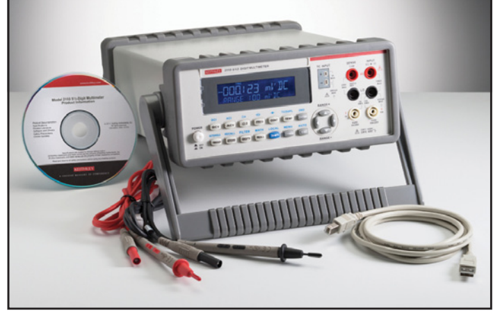
All accessories, such as start-up software, USB cable, power cable, and safety test leads, are included with the Model 2110.

Reference Manual on CD, Specifications, LabVIEW® Driver, Keithley I/O Layer, USB Cable, Power Cable, Safety Test Leads, KI-Tool, and KI-Link Add-in (both Microsoft Word and Excel versions), Calibration Certificate