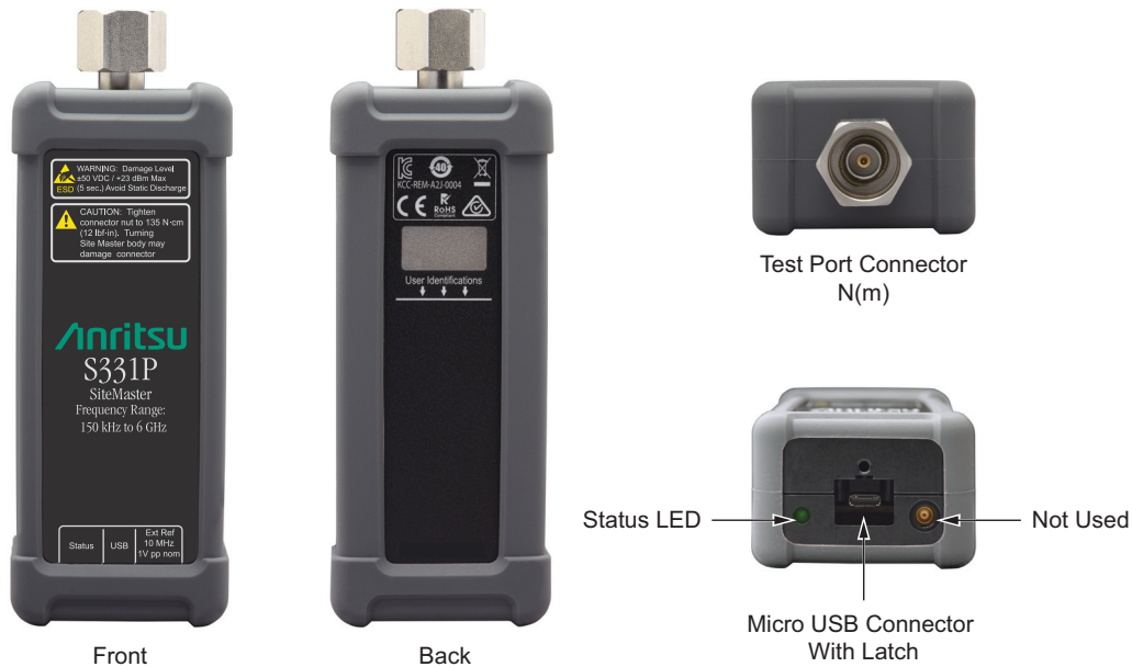
Site Master™ S331P Cable & Antenna Analyzer Featuring USB Connectivity with a Windows PC or Tablet Size: 52 mm x 148 mm x 36 mm (2 in x 5.8 in x 1.4 in), Lightweight: < 0.4 kg (< 0.9 lb)