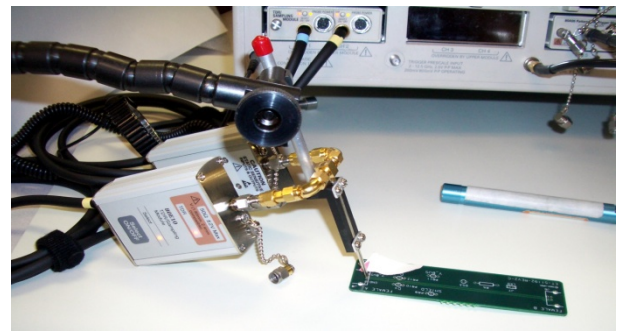
Fig 2) For a faster TDR pulse, remove the cable and directly connect the GigaProbes™ directly to the TD sampling head via a high speed coupler.