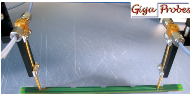
Fig. 1) Two GigaProbes™ connected through SMA cables and to the TDR heads are used to acquire the differential Reference (Open), TDR, TDT Waveforms and ported into IConnect® for processing.